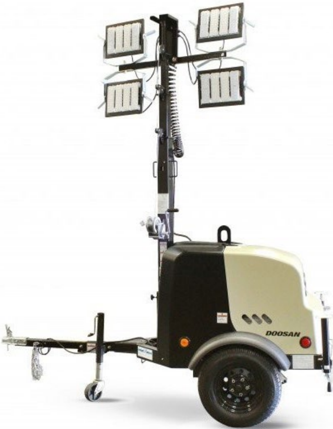
DOOSAN LED LIGHT TOWER