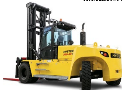
HYSTER PNEUMATIC TIRE INDUSTRIAL FORKLIFT