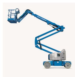
GENIE ARTICULATING BOOM LIFT

*Please contact your salesman for Upright Aluminum Scaffolding packages and availability.