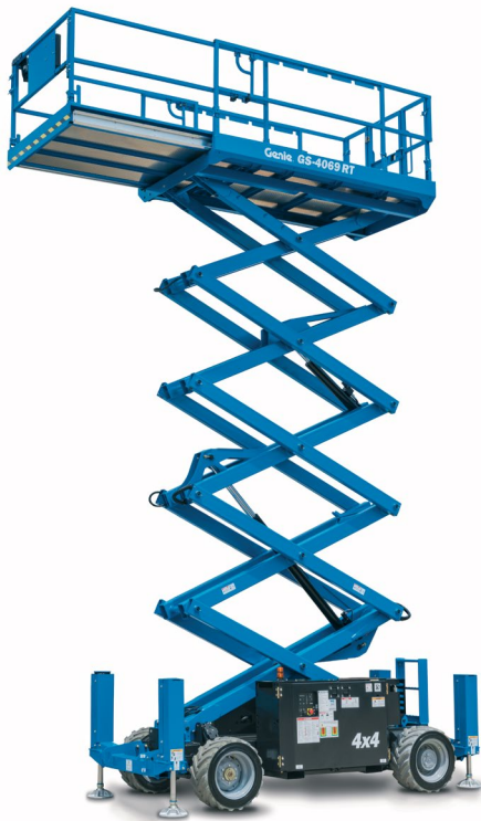
GENIE SCISSOR LIFT