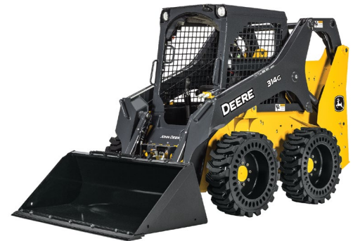
JOHN DEERE SKID-STEER LOADER