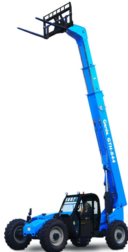
GENIE ROUGH TERRAIN HANDLER