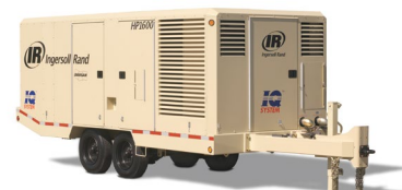
DOOSAN AIR COMPRESSOR