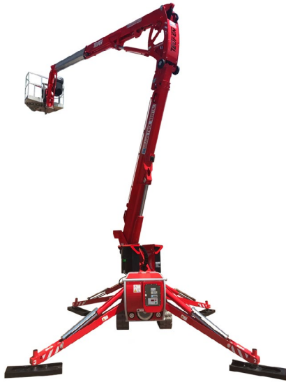
TEUPEN CRAWLER BOOM LIFT