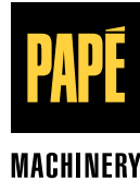
PM9 - HEADWEAR ONLY