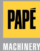
PM12 - HEADWEAR ONLY