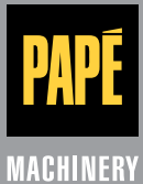
PM11 - HEADWEAR ONLY